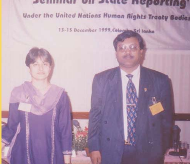
Seminar on State Reporting Under the United Nations Human Rights Treaty Bodies, Photo shows : (from left) Secretary General of BHRC and ICJ Program Officer.