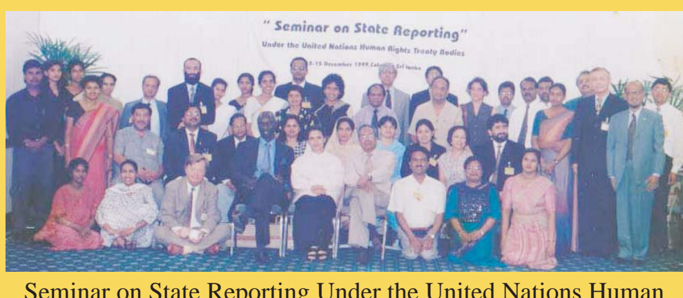
Seminar on State Reporting Under the United Nations Human Rights Treaty Bodies, attend the South Asian Participator, Organized by ICJ and UN High Commission for Human Rights