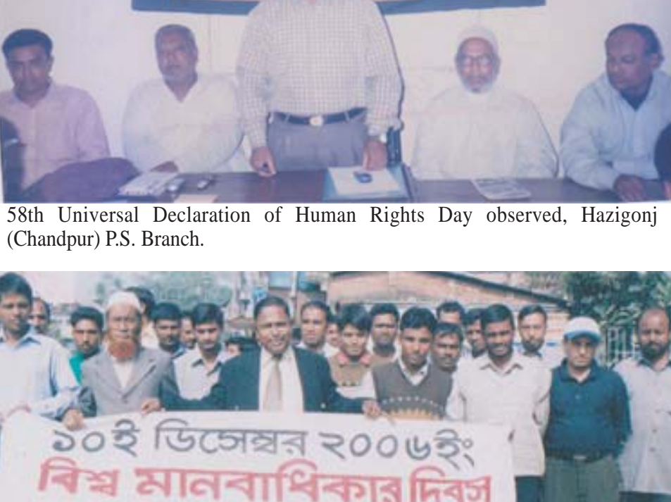
58th Universal Declaration of Human Rights Day observed, Mymensingh City Branch.